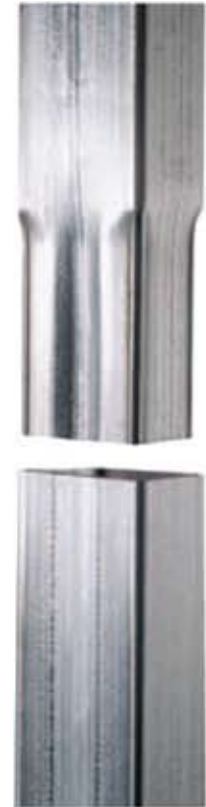
Easy "SLIP-FIT" Assembly