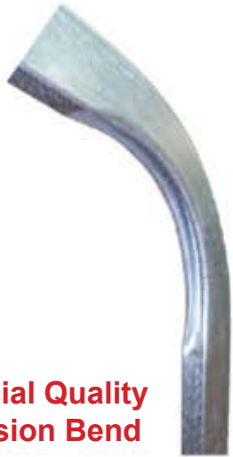
Commercial Quality Compression Bend